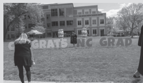
Photo Station 1: Jefferson Lawn, one block north of Chicago Ave. on Brainard St.

Don't forget to capture the moment and take photos of your grad at our three photo stations on campus.