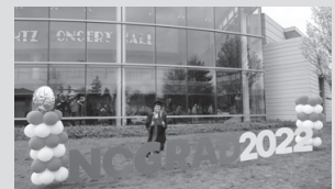
Photo Station 3: On the Fine Arts Center front lawn at the corner of Chicago Ave. and Ellsworth St. Take Brainard St. one block north to Chicago Ave., then one block west.