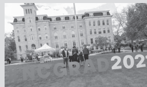
Photo Station 2: Old Main lawn, three blocks north of Chicago Ave. on Brainard St.