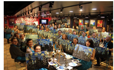
Photo: International Club at Pinot's Palette Naperville